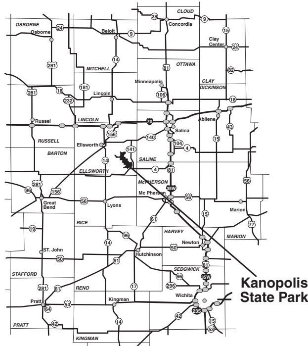
General Area Map

Download the CampIt KS mobile app today and reserve your Kansas State Park campsite from anywhere, on any mobile device! Available now in the Apple App and Google Play stores.